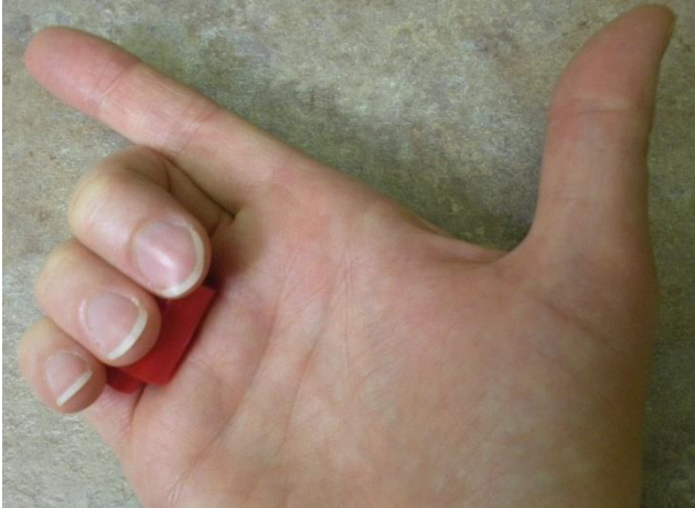
FOR RIGHT HANDERS