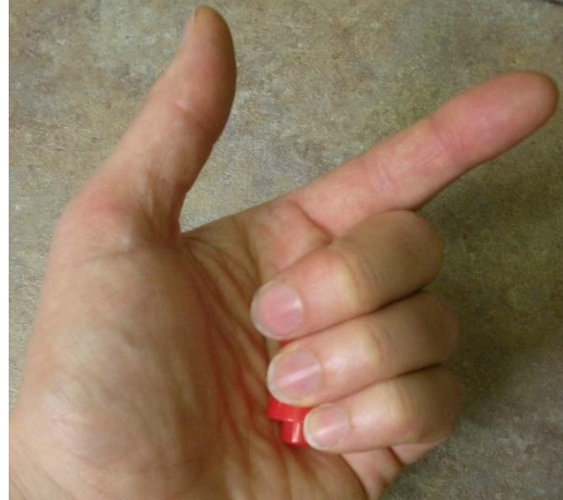
FOR LEFT HANDERS