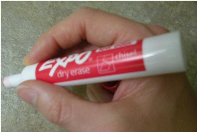
FOR RIGHT HANDERS