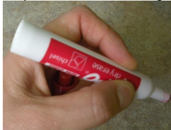
FOR LEFT HANDERS